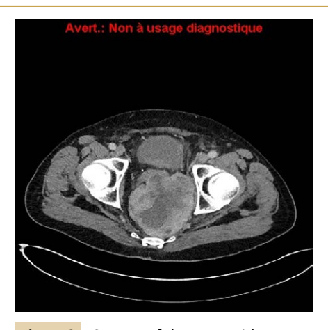
Figure 2 Contact of the mass with rectum.